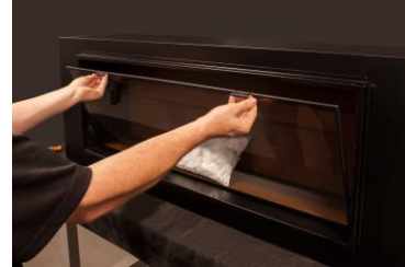
Carefully remove glass panel by pulling on the tabs located on the left and right side of the firebox.