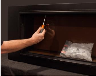
Locate screws holding in the glass and remove