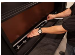
Locate RGB light strip and remove paper covering sticky strip. Place RGB light strip along bottom rail of Z metal attached to unit.