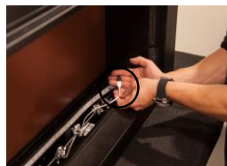
Locate plug on the RGB light strip and the driver box. Plug in wires to each other.